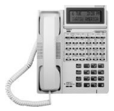
IX-12KTD-2 with IX-12ELK, gray and ash