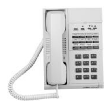
IX-VTA, gray and ash