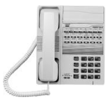
IX-12KTS-2, gray and ash